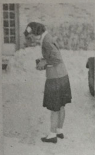
caught in the act