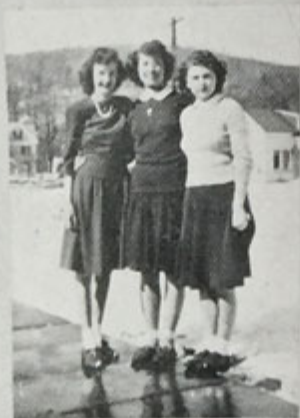
where's the Men?