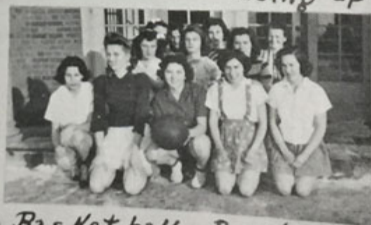
Basket ball Practise