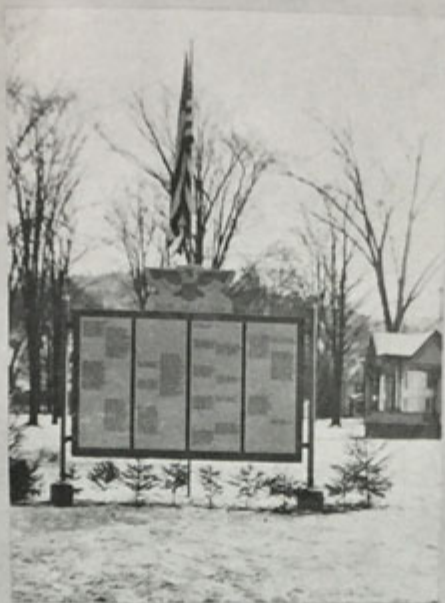
Service Men's Plaque