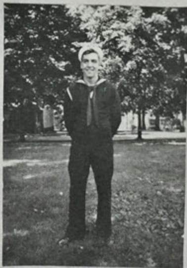
Guy Craft S 2/c