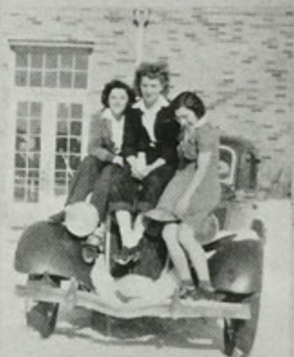
On the Wagon