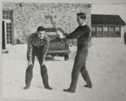
TAKE it easy!