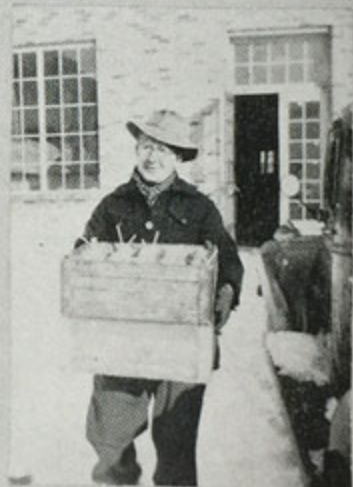
"Keep those bottles quiet"