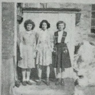
Freshmen Pals H