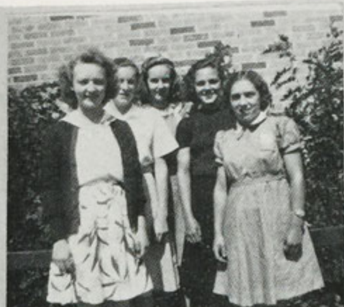
Freshmen of '41