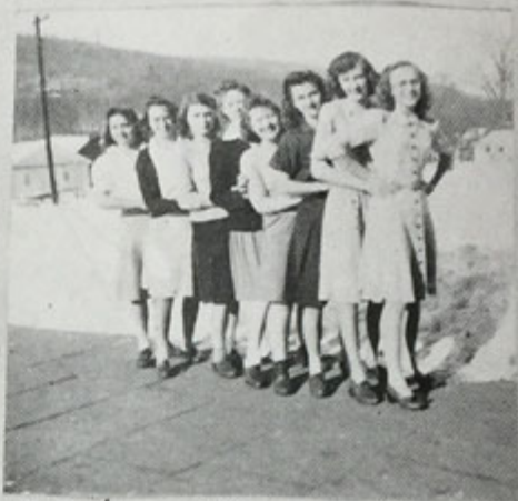
One, two, three, -Kick!