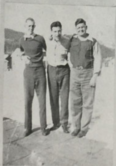
I fool so feelish —