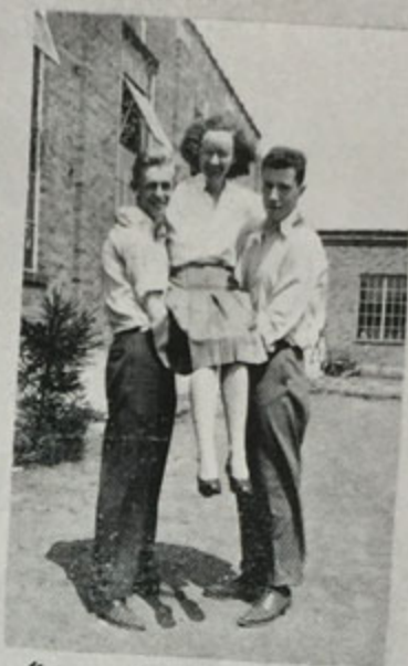
"Our Best Gal!"