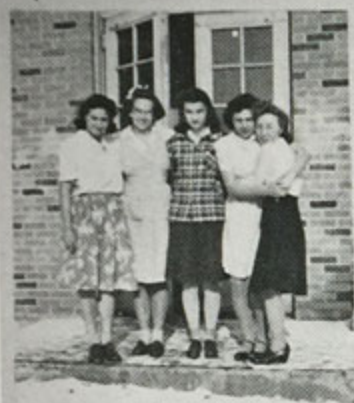
Brr! IT's cold