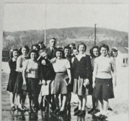
Man Shortage !!!