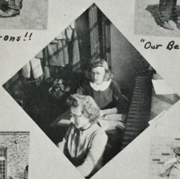
Staidous, aren't they?