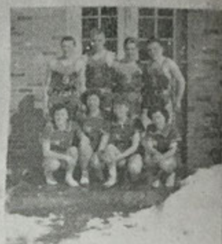
Alumni of '46