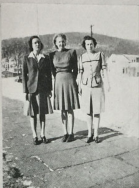
Three Snug Bups!