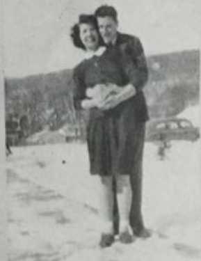
what a pose!