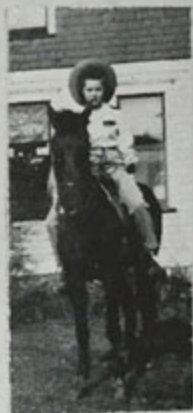
Ride 'em, Cowgirl!