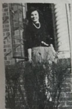
What, a Pose?