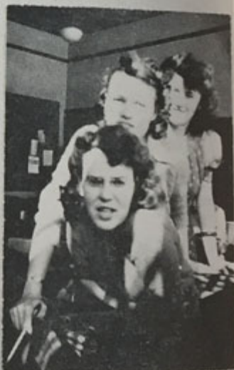
The SUN IS IN My eyes