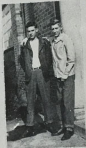
THREE MORE YEARS!